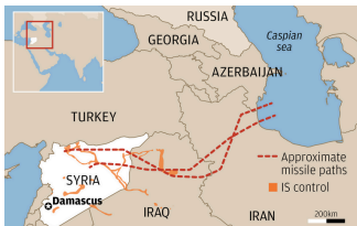
Missile tracks on 06OCT15

SITA HNLFSXH AKLFSXH AFTN KMCXAAL EMAIL INTL.DESK@FSBUREAU.ORG